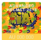
Helmet with ABP