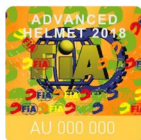
Helmet without ABP